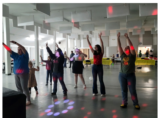
Hugo Auxiliary 6612 had their 1st Annual Family Night New Year's Dance for HS Students & their parents/siblings. Students pictured with their hand up enjoying a song to dance to. The event was held at Lincoln County Fairgrounds in Hugo, CO